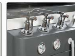
■ Spray gun block