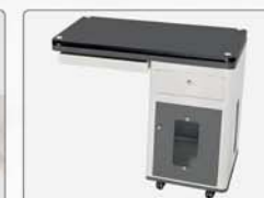
■ Writing table (Option)