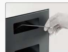
■ Contaminated instrument tank