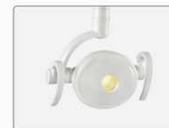
■ LED illuminating