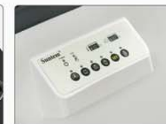
■ Control panel