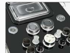
■ Well-designed working table (luxury glass table for medical instruments and medicine bottle)