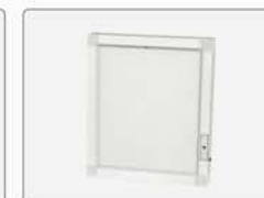
■ LED film viewer