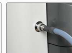
■ Built-in cold light source(LED)