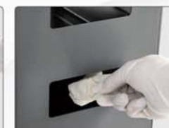
■ Built-in waste tank