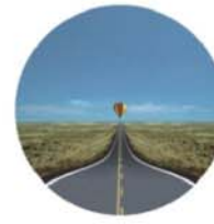
Automatic mist target, effectively reduce the measurement error caused by adjusting