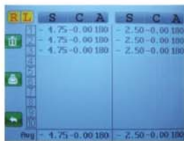
Most each record 10 times, automatic display representative value