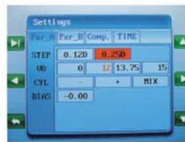
Intuitive interface, convenient adjustment, the VD value, the precision and print mode, etc