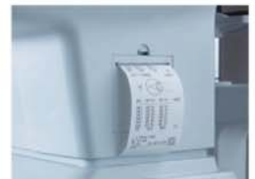
Fast thermal printer