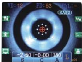
5.7 inch color LCD monitor