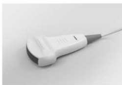
3.5MHz Convex Probe