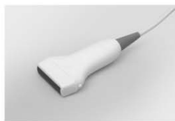
7.5MHz Linear Probe