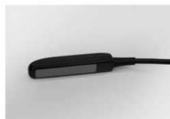
6.5MHz Vet Rectal Probe