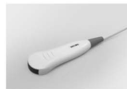
5.0MHz Micro-convex Probe