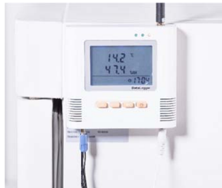
Data Logger (Optional)