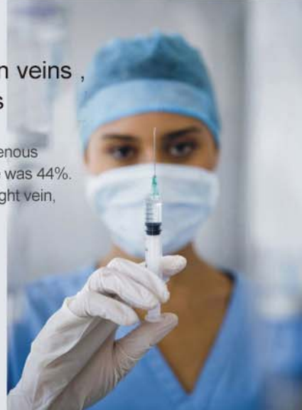
Image enhancement increases the venous recognition of more than 90% .

According to statistics, the failure rate of the first venous puncture of adults was 28%, and the pediatric rate was 44%. The main reason is that it's not easy to inject the right vein, and it can help you solve the problem.